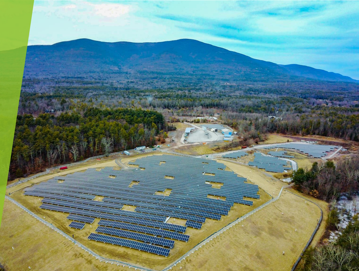
East Light solar farm at Saugerties landfill